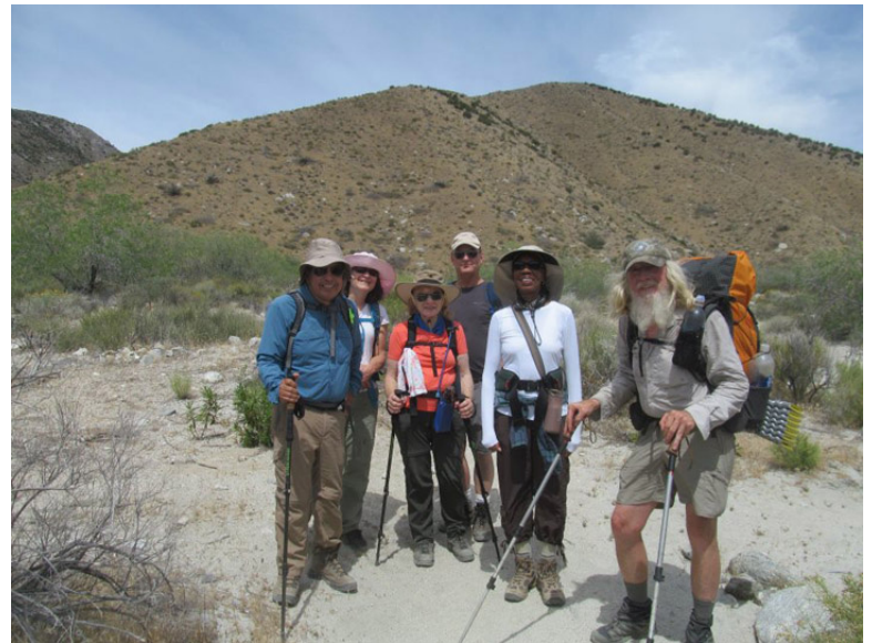
Hiking Whitewater Preserve on May 6, 2018.

Biological Diversity has challenged the Riverside County Board of Supervisor's approval of this 8,725-unit development on the south edge of the San Jacinto Wildlife area. A