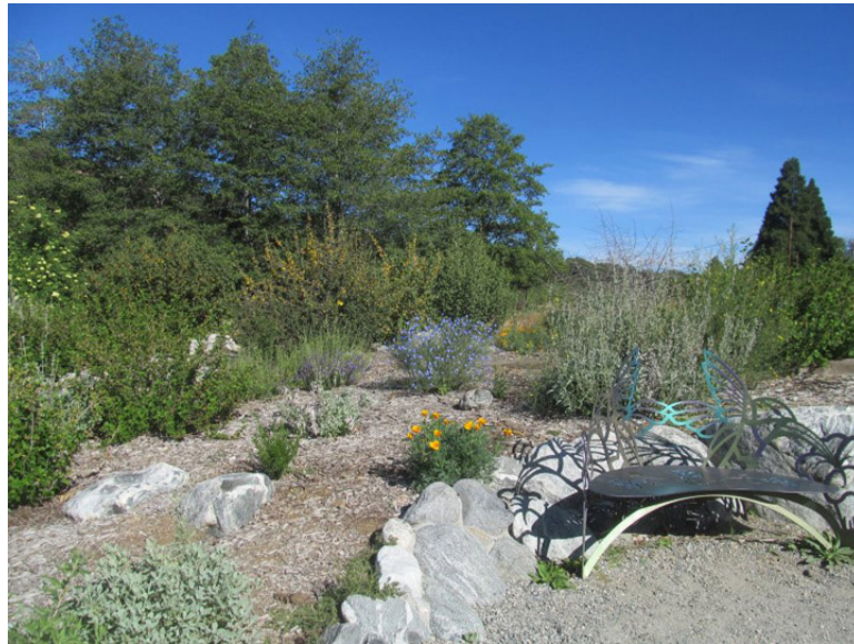
Oak Glen Wildlands Conservancy

Villages of Lakeview (VOL): A coalition of environmental groups represented by Center for Biological Diversity has challenged the Riverside County Board of Supervisor's approval of this 8,725-unit development on the south edge of the San Jacinto Wildlife area. A